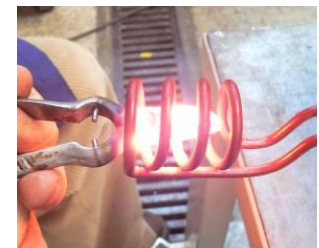
Tube brazing and tool heating example